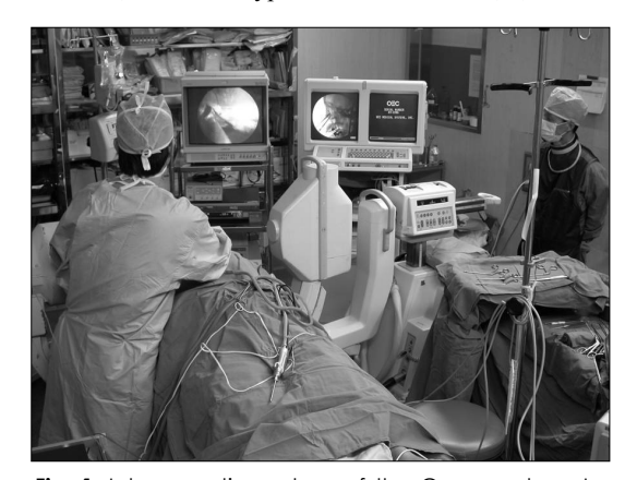
Fig. 1. Intraoperative set-up of the C-arm system. Intraoperatively, the C-arm is checked by placing a frontal sinus curette or frontal sinus seeker at the point of concern. Information acquired in endoscopic view and from C-arm and CT images, increases confidence of the frontal recess anatomy.

Ten of the 15 patients were undergoing revision surgery (Table 1). Agger nasi cells, supraorbital cells, and frontal cells were detected in 10, 7, and 6 of the patients, respectively. In two patients, we could not identify pneumatization patterns around the frontal recess due to anatomic derangement caused by previous surgery. Of the 9 patients in whom we could identify uncinate process attachment types, lamina papyracea, skull base, middle turbinate, and mixed types were detected in 5, 1, 1 and 2