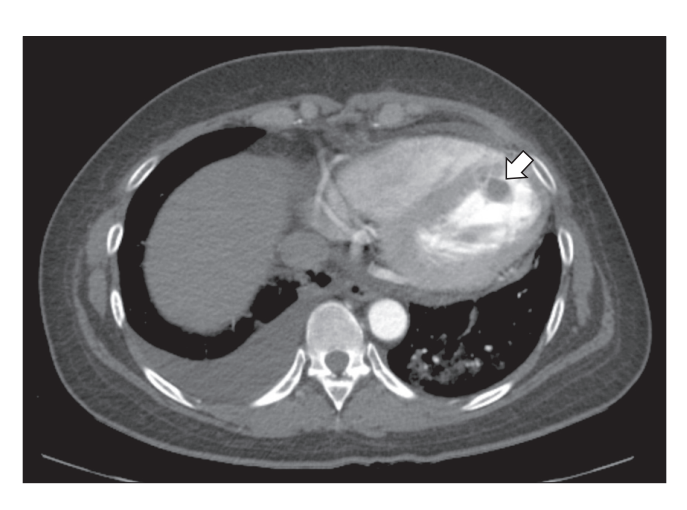
Fig. 2. Chest computed tomography shows capsulated space occupying lesion with 1.7 cm in diameter in left ventricle (arrow).

36.9°C. The patient appeared acutely ill with an alert mental state. A crackling sound was auscultated on both lower lung fields, and her heartbeat was regular, without significant murmur. The examination of her abdomen was unremarkable; a grade IV pitting edema was observed. Her body weight had increased from 64 kg to 79.2 kg over one week. On simple chest radiography, a pulmonary edema was seen in both lung fields with cardiomegaly (Fig. 1), and an electrocardiography (ECG) showed sinus tachycardia with poor R progression on the chest lead and T wave inversion in the limb leads. Under the impression of congestive heart failure