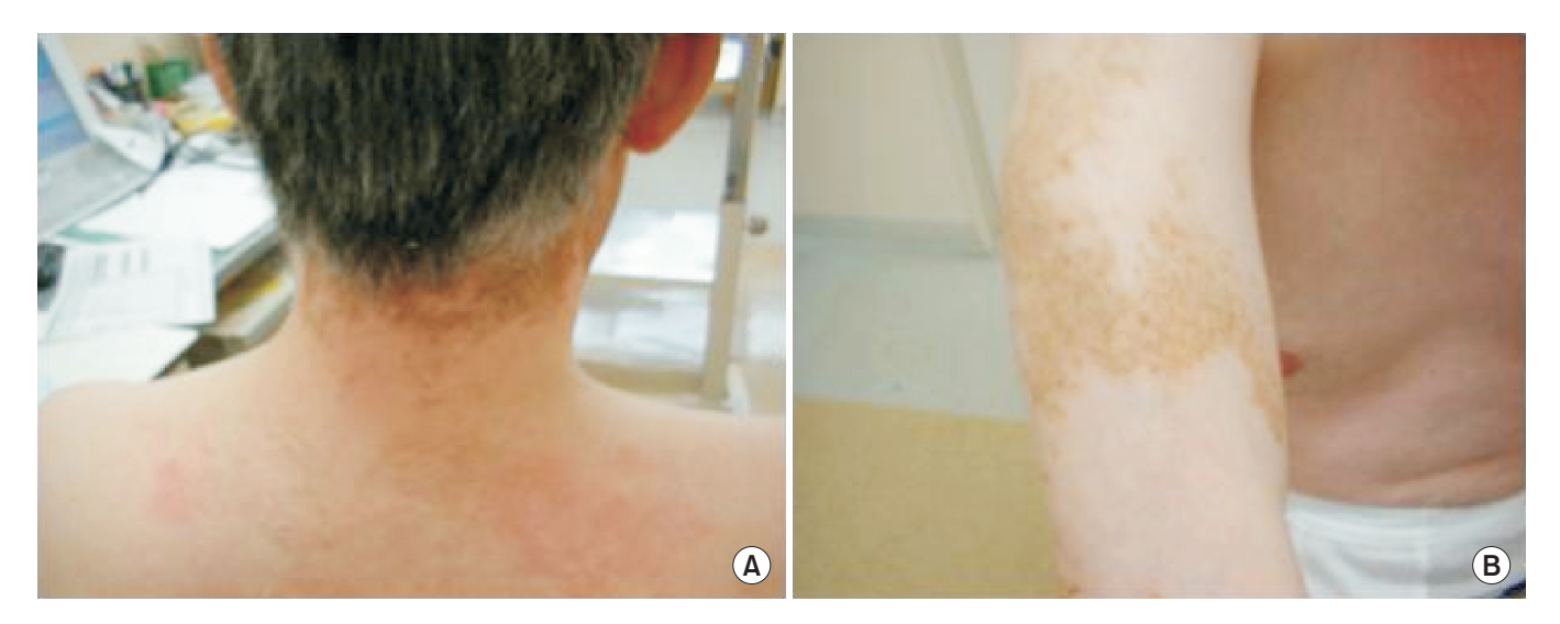
Fig. 1. Vitiligo. Depigmented patches are shown on the neck and upper back (A) and on the arm (B).