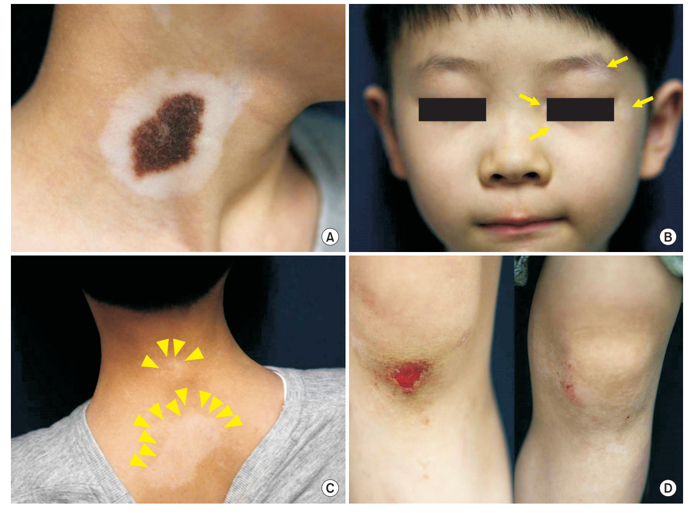
Fig. 1. Clinical images at initial visit. (A) A 6 cm-sized patch with central pigmented hairy lesion surrounded by a whitish halo phenomenon on right neck. The whitish halo surrounding the congenital central lesion was developed 3 years in prior to visit. (B) Multiple variegated-shaped whitish patches on left periorbital area (arrows) where the corrective vision braces was in touch. Lesions had developed 1 year in prior to initial visit. (C) Multiple irregularly shaped whitish patches on posterior nape and upper back area (arrow heads). Lesions had developed 1 year in prior to initial visit. (D) Whitish patches around wound area of the right knee (right) and left knee (left). Lesions had developed 1 year in prior to initial visit.

Skin biopsy was performed on the center of the congenital melanocytic nevus and the scanning view revealed heavy infiltration of nevus cells at the upper dermis (Fig. 2A). Middle to lower dermis presented groups of nevus cluster with no definite atypia (Fig. 2B). In addition, skin biopsy was performed on the surrounding whitish area and revealed significant reduction in melanocytes and melanin pigmentation (Fig. 2C). Higher magnification revealed mild infiltration of the lymphocytes (Fig. 2D). Based on the clinical and pathological findings the patient was diagnosed with halo nevus surrounding congenital melanocytic nevus concurrent with vitiligo. The patient was prescribed