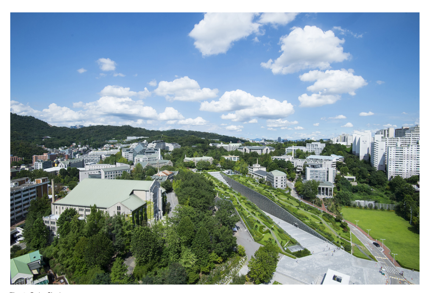
Fig. 2. Ewha Sinchon campus.

of the tremendous vulnerability of people in front of a virus that has spread with great speed and deadly effect around the world due to the hyperconnected world we live in, and the damage we have done to the natural environment through rapid urbanization and industrialization.