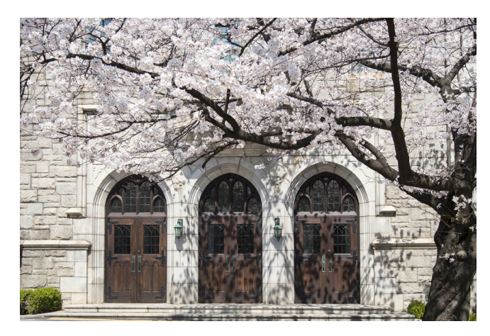
Fig. 3. A blooming spring view of Case Hall (Graduate School Building).

Along with the Fourth Industrial Revolution now underway, we must take up the challenge for digital transformation in all disciplines. In particular, we note that the medical field is no exception with the need to embrace artificial intelligence, big data, neuroscience and biotechnology and more. Ewha with two teaching hospitals, College of Medicine and the research university in Sinchon encompassing the full spectrum of aca—