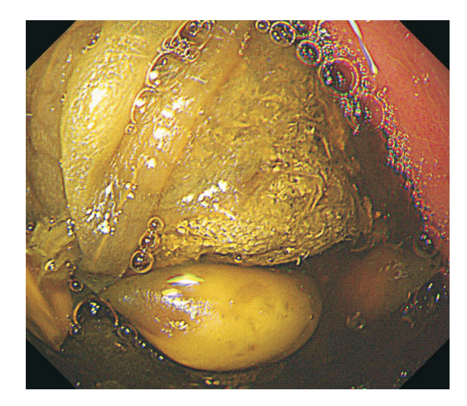
Fig. 2. Endoscopy shows a ball of fiber impacting the antrum pylorus. Informed consent for publiccation of the clinical images was obtained from the patient.

A CT scan of the abdomen it showed a 5-\times4- cm, firm, atypically shaped mass at the stomach body and duodenal bulb with interspersed gas (Fig. 1). Esophagogastroduodenoscopy showed a mass of fiber impacting the antrum pylorus. Multiple ulcerations with blood clots were observed in the antrum and angle (biopsy was performed, and pathologic results showed a