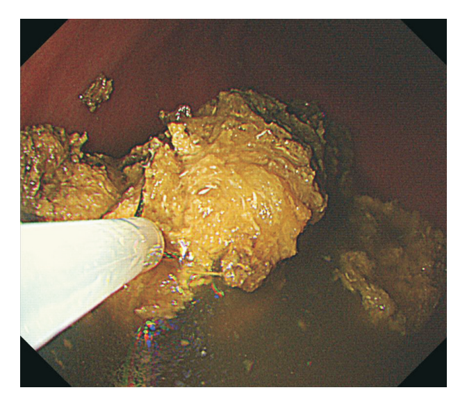
Fig. 3. Endoscopy shows fragments of brittle bezoar soaked in olive oil. Informed consent for publiccation of the clinical images was obtained from the patient.