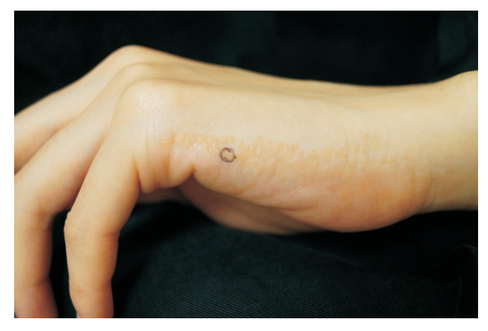
Fig. 1. Clinical findings. Multiple yellow flat discrete papules and plaques were observed along the lateral aspect of both hands.

FAH is often considered to be a variant of acrokeratoelastoidosis, although their relationship is controversial. The differential diagnosis with acrokeratoelastoidosis can be made by the