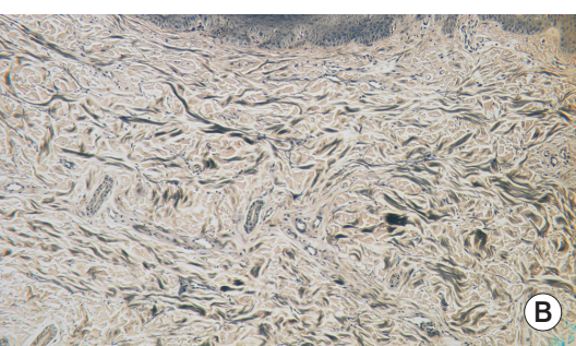
Fig. 2. Histologic findings. (A) Focal depression of epidermis is observed with marked hyperkeratosis and hypergranulosis (H&E, ×40). (B) There is no alteration of elastic fibers (Verhoeff-van Gieson, ×100).

Received September 13, 2021, Revised October 6, 2021, Accepted October 6, 2021