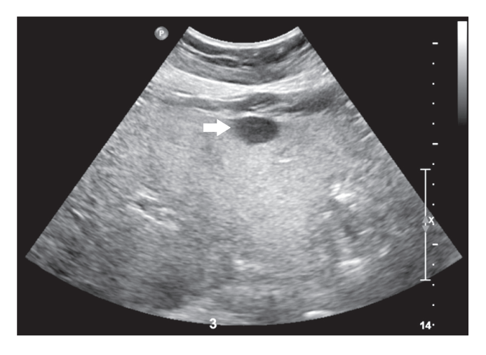
Fig. 1. Abdominal ultrasonography. It shows a 1.6 cm size well-defined hypoechoic nodule in liver segment III (arrow).

g/dL; platelet count, 165,000/mm<sup>3</sup>; albumin, 4.4 g/dL; aspartate aminotransferase (AST), 46 IU/L; alanine aminotransferase (ALT), 63 IU/L; total bilirubin, 0.5 mg/dL; creatinine, 0.7 mg/