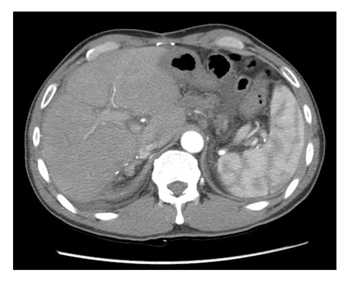
Fig. 1. Abdominal computed tomography (CT). Liver CT (portal phase) shows a normal appearance except for the "periportal collar," observed as linear periportal hypoattenuating areas.

progressive disease with enlarged retroperitoneal and perigastric lymph nodes, but without morphological abnormalities, including biliary tract dilatation. The previously noted hepatic metastases were nearly invisible. Chemotherapy-related toxic hepatitis was suspected, and all treatment was postponed for 1 week.