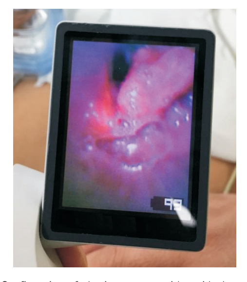
Fig. 3. Confirmation of glottic exposure with a videolaryngoscope before anesthesia induction.

Thorough evaluation before anesthesia, including meticulous