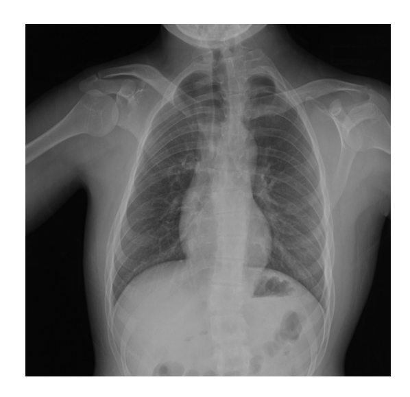
Fig. 1. Chest radiograph.

On the patient's arrival at the operation room, standard monitors, including electrocardiogram, non-invasive blood pres-