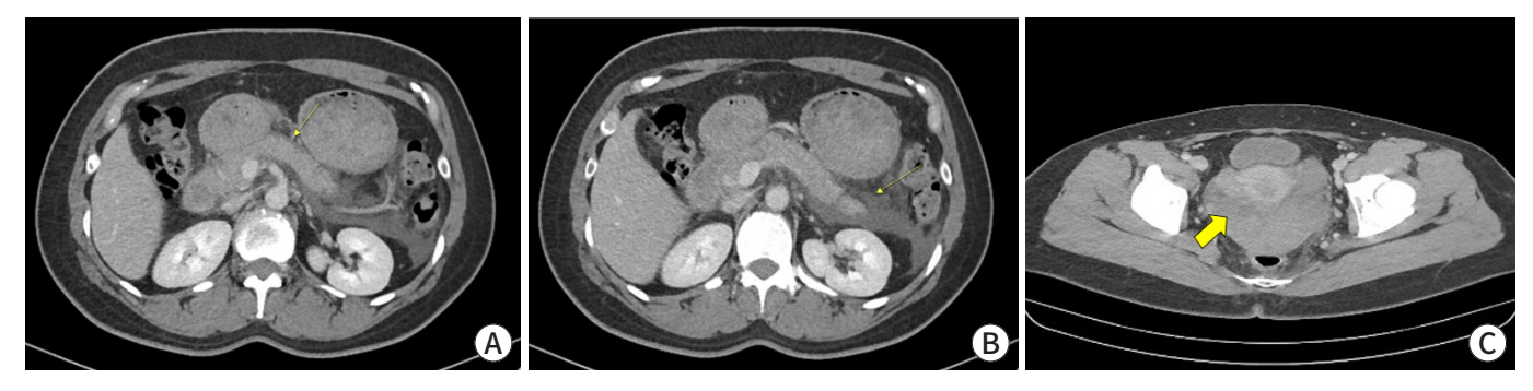
Fig. 1. Abdominal pelvic CT scan on admission day. (A) Pancreatic parenchyma enhancement by intravenous contrast agent. Acute inflammation of the pancreatic parenchyma and peripancreatic tissue, with stranding of the surrounding fat. (B) Acute peripancreatic fluid collection in the left anterior pararenal space. (C) Acute hematoma (arrow) in the cul-de-sac without active bleeding.

Transvaginal ultrasonography revealed an empty uterus with 2.53 mm thick endometrium