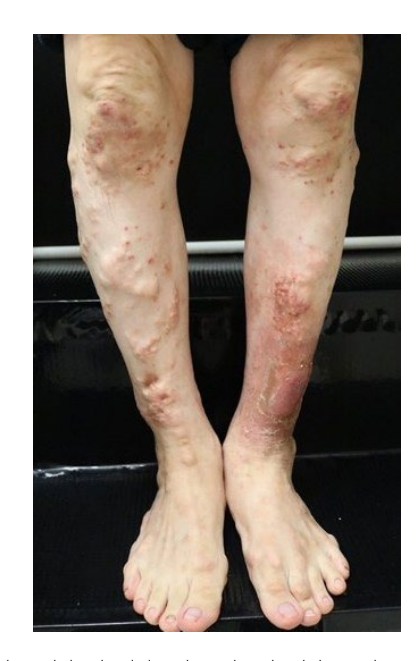
Fig. 1. Multiple yellowish, firm papulonodules had developed on both lower legs. Some lesions showed acute suppuration.

Gout is a chronic disease characterized by the deposition of monosodium urate (MSU) crystals, which form when urate concentrations are elevated [1]. These MSU crystals can accumulate in joints, bones, and various body tissues, including the skin and soft tissues. The disease can be